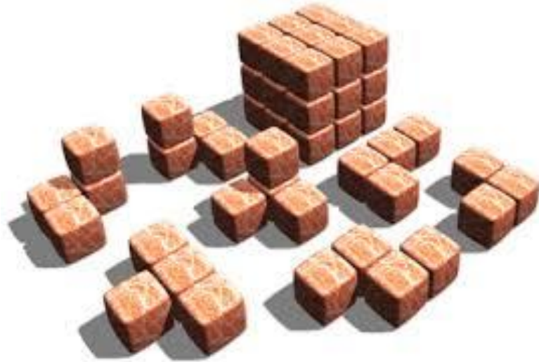
The Soma Cube